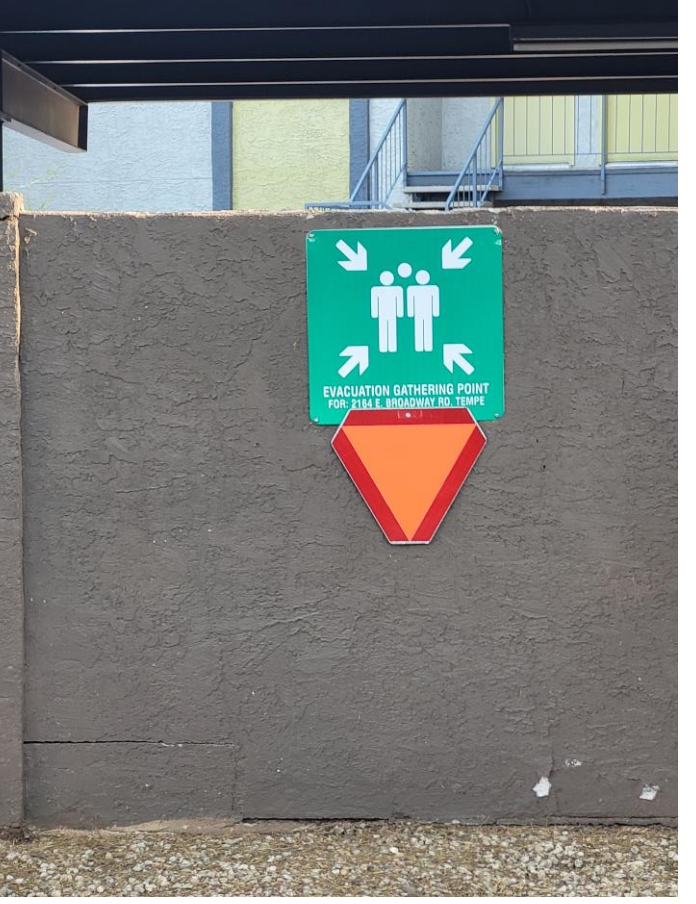
Medical Center Meeting Area